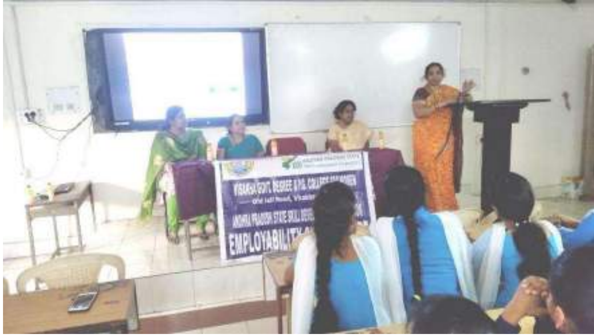
Principal addressing students in the valedictory function