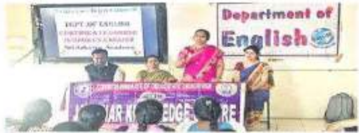
ప్రభుత్వ మహిళా కళాశాలలో జరిగిన సమావేశంలో ప్రసంగిస్తున్న ప్రాధాన్యత కళాశాల