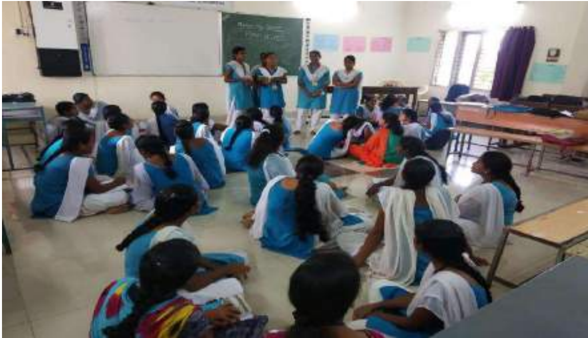
Students in Group Activity