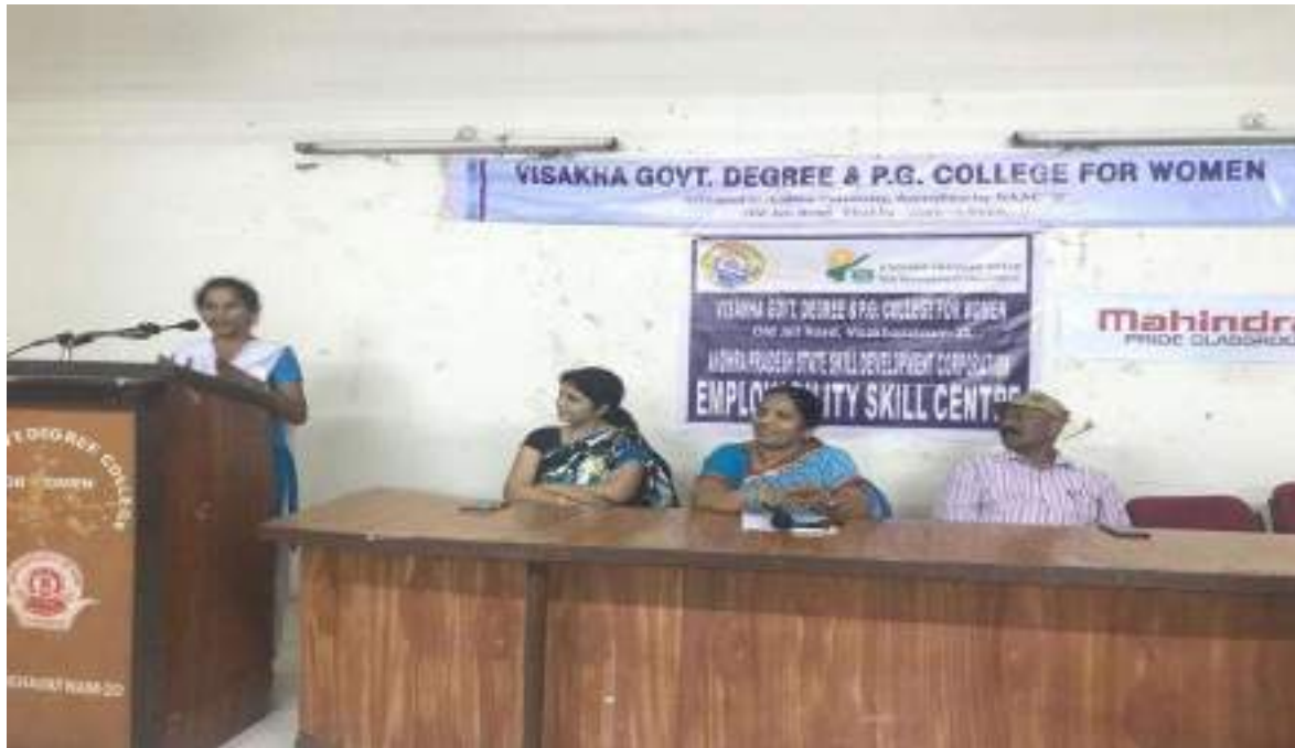
Student Feedback in the Valedictory Function