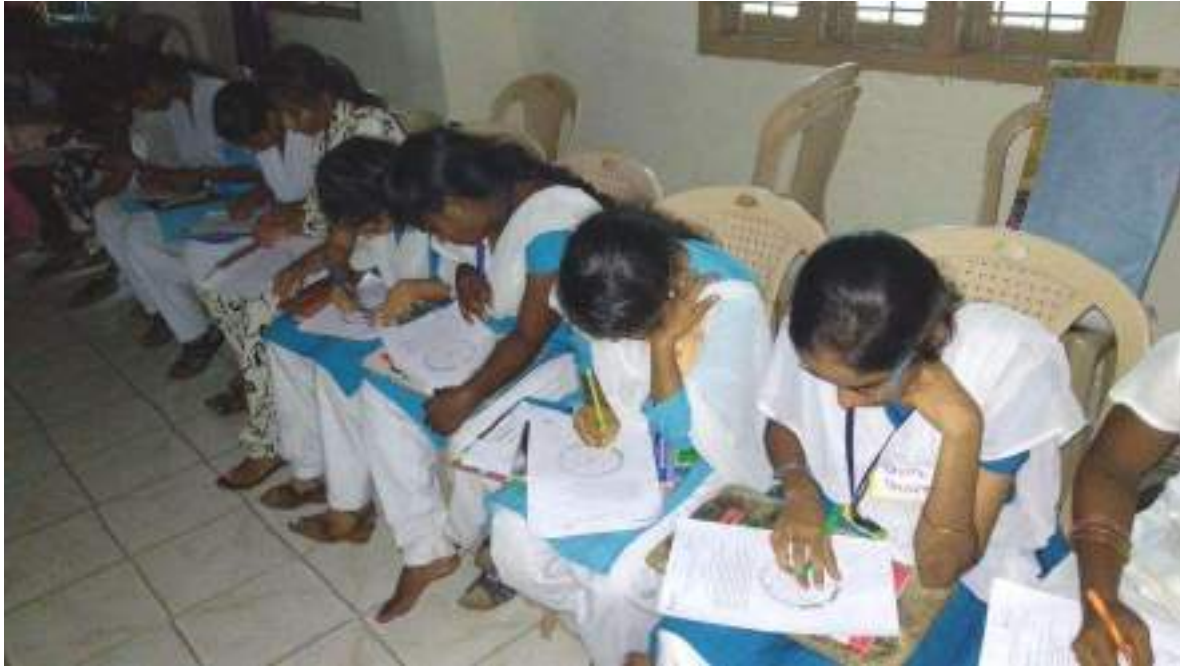
Students participating activities