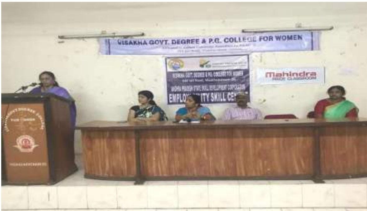
JKC Coordinator addressing the students