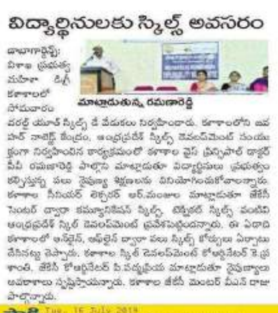
Varatha & Sakshi Press Clipping