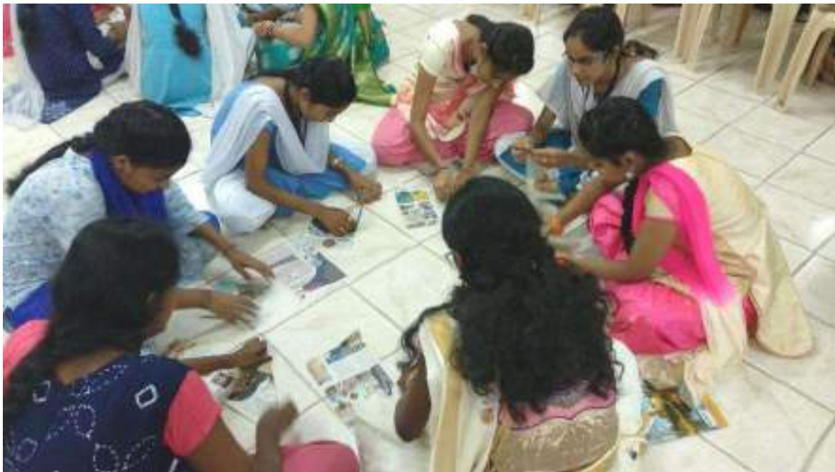
Students in Group Activity