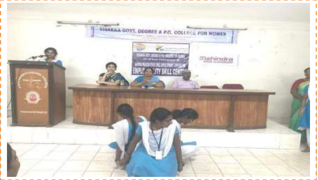
Students presenting a program in the Valedictory function