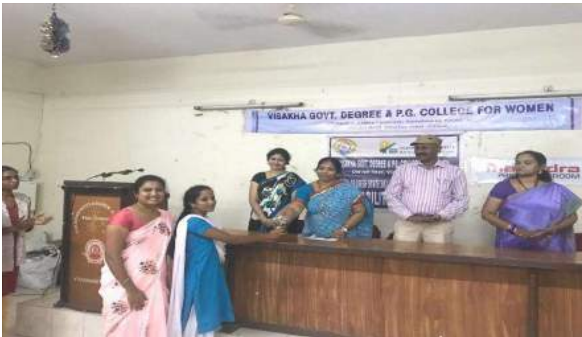
Trophies to the best performers in the skill development program