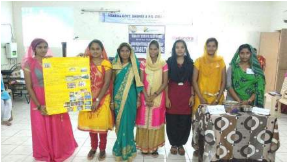
Students representing various cultures as a part of activities