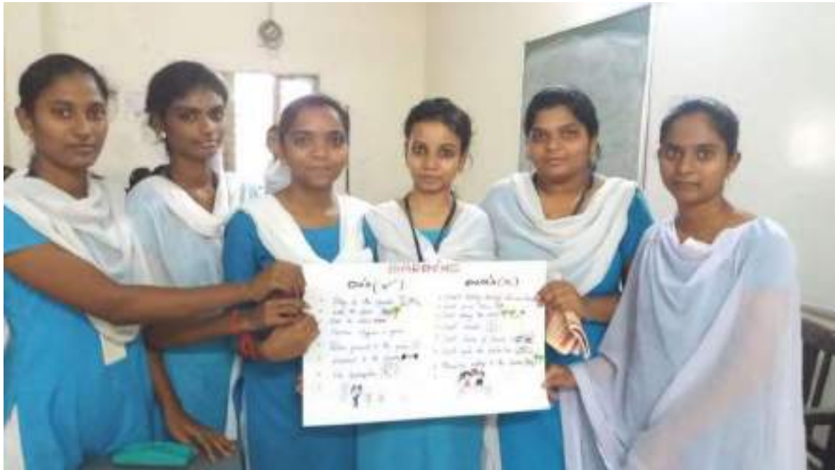
Expressing Views in a Group Activity