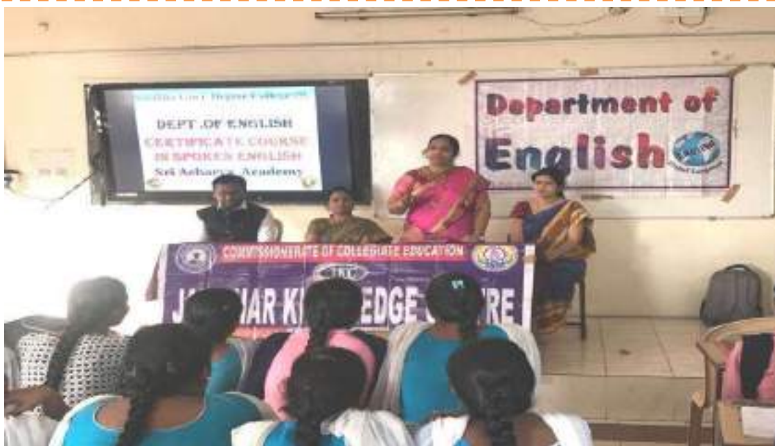
Principal speaking on the Certificate course- Spoken English