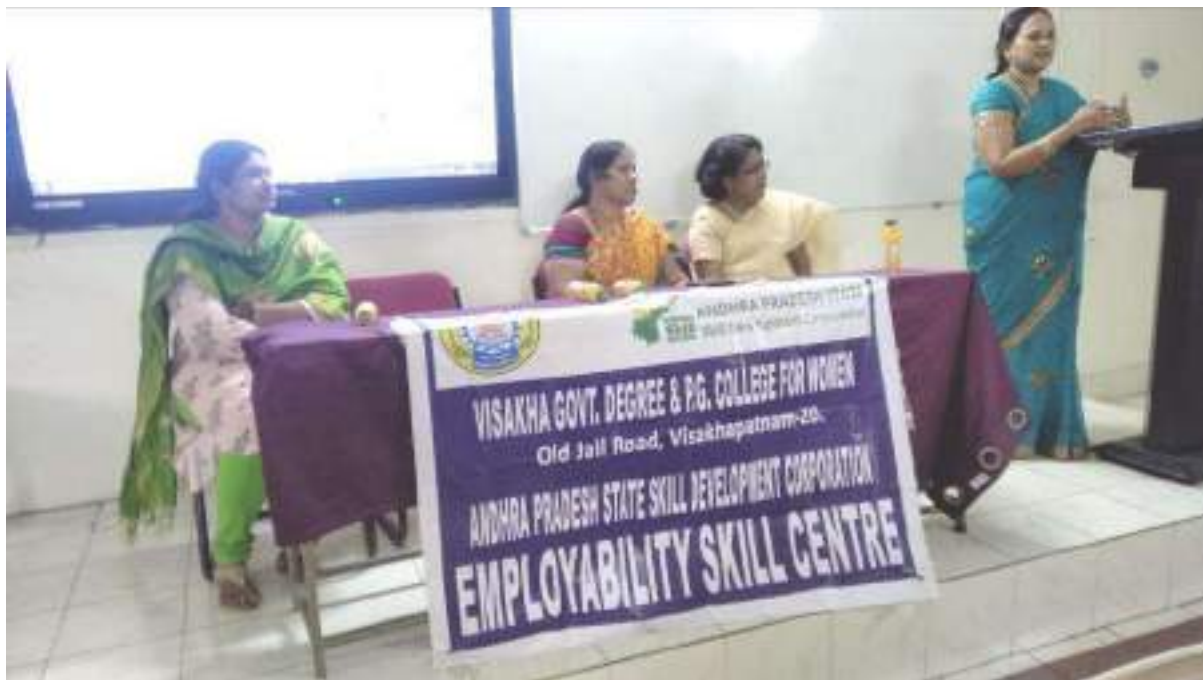
JKC Coordinator in the valedictory function