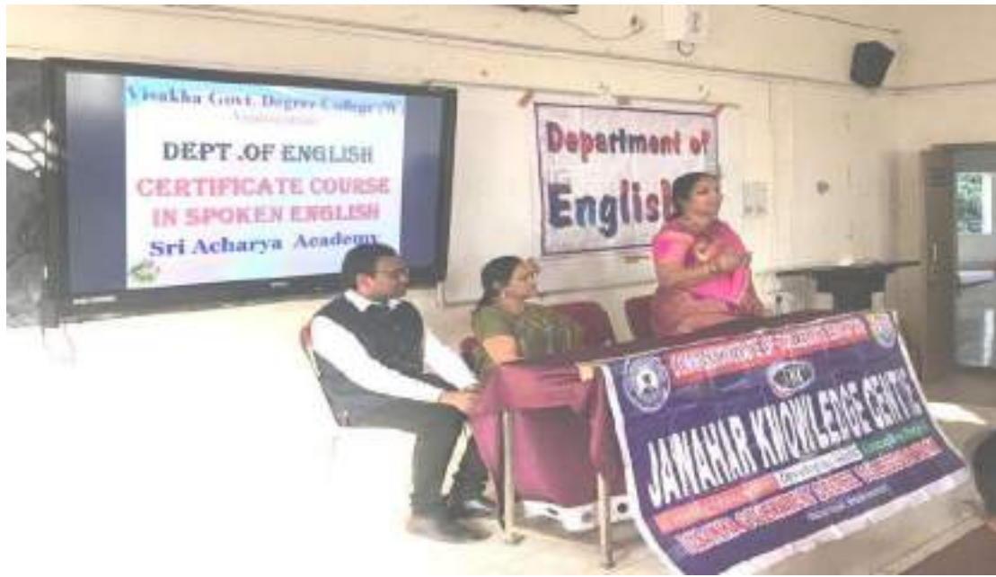
INAUGURAL OF THE CERTIFICATE COURSE