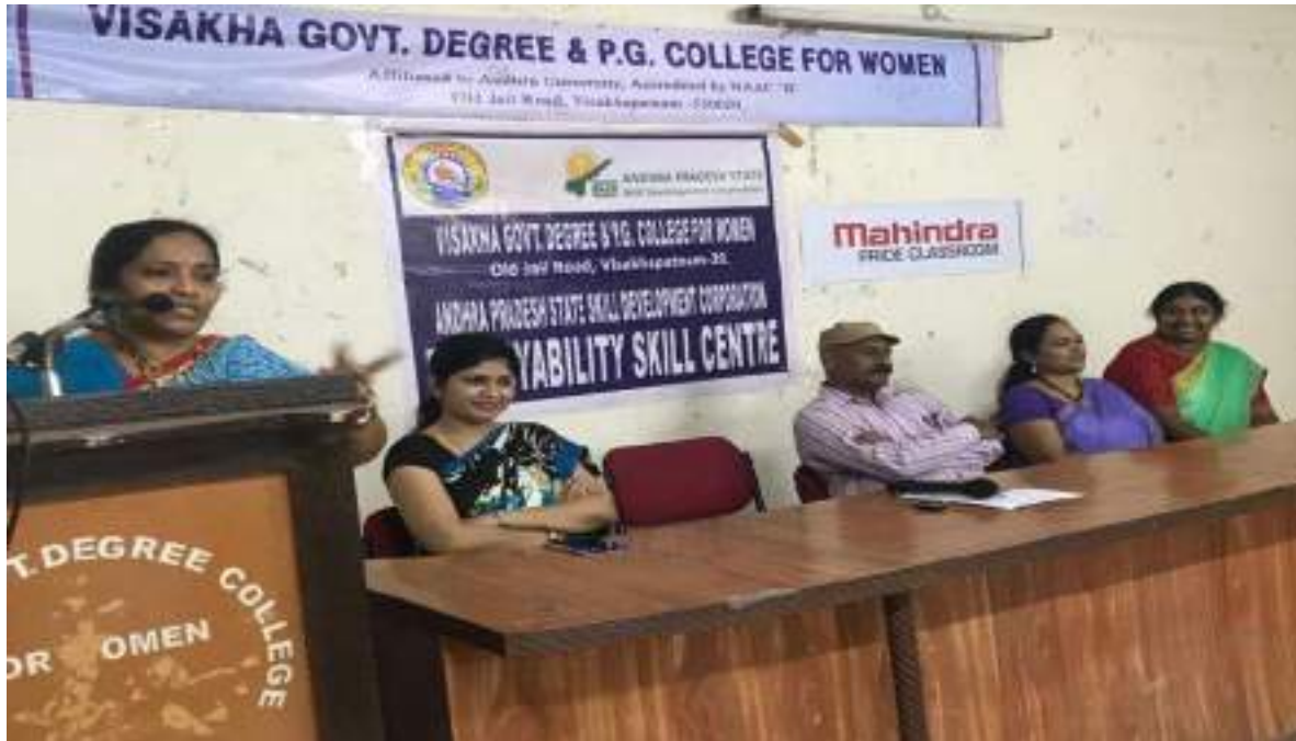
Principal addressing the students